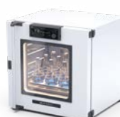
HEATING / COOLING / TEMPERING