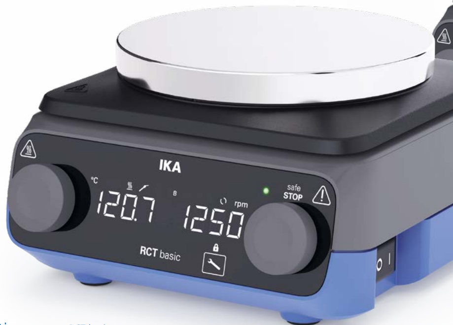
RCT basic Ident. No. 0025008259